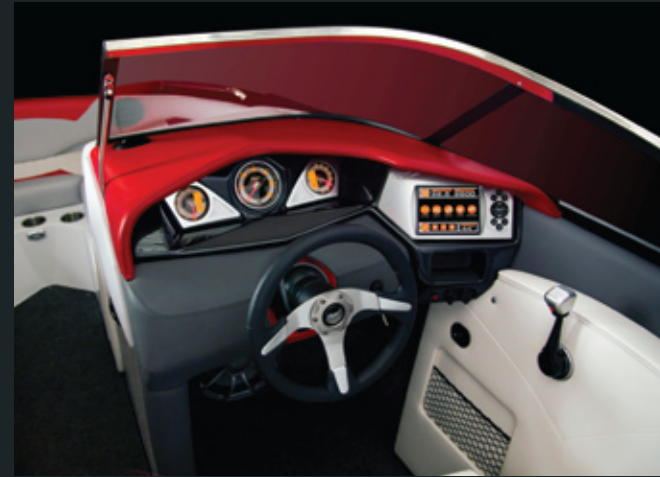
Low-profile dash designs for maximum visibility.